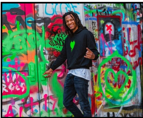
Young Pine, 2021