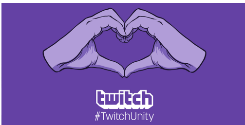
Twitch Unity and Fundraising

Simply put, donation streams will be a lot easier for viewers and streamers with this new feature, Twitch Charity. The platform plans to start with a limited amount of available charities, but says they will add more in the future. So, to all those Twitch streamers, try your hand at charity streams, and raise money for a good cause with a few easier clicks to get you started.