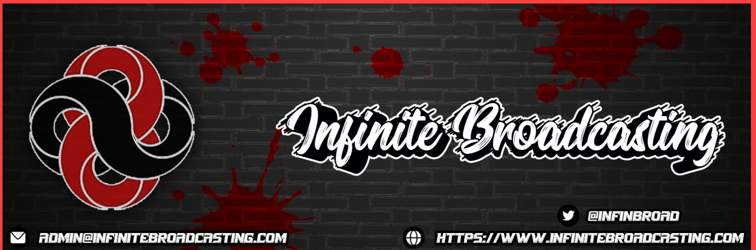
Infinite Broadcasting Header -Stephen Art