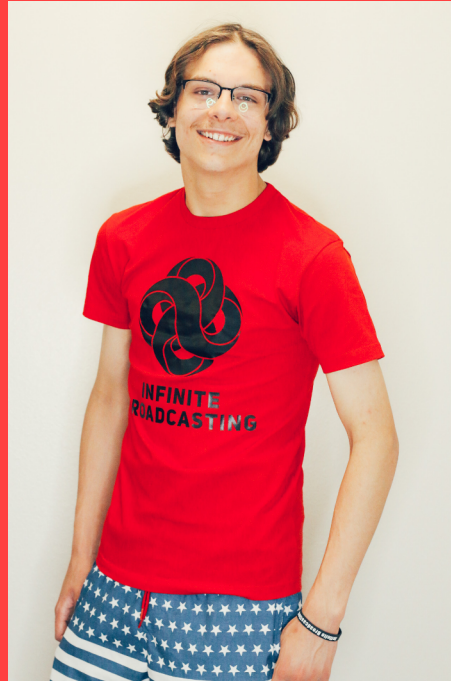
OG One Tone T-Shirt