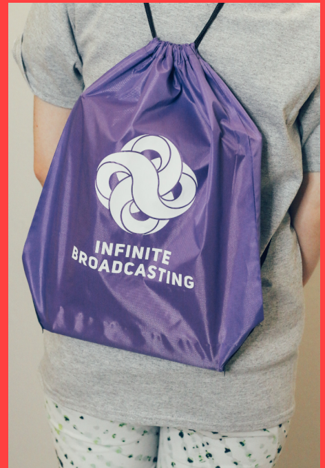
OG Drawstring Bag

NEW IB SUMMER SERIES TO BE REVEALED THIS MONTH! STAY TUNED!