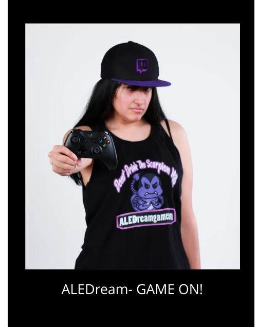
ALEDream- GAME ON!

"I would be an owl because Owls are my favorite animal. I love owls because they stand for wisdom and they are gorgeous creatures."